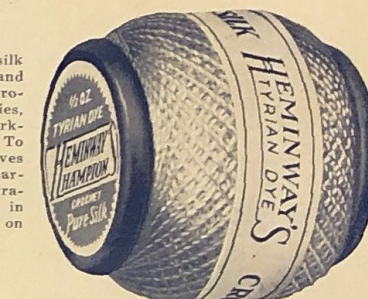
HAMPTON PURE CROCHET SILK

This silk is exactly the same as HEMINWAY HAMPTON, except that it is put up on \frac{1}{4} oz. spools of 70 yards each. The same high grade results are assured by the use of this crochet thread.