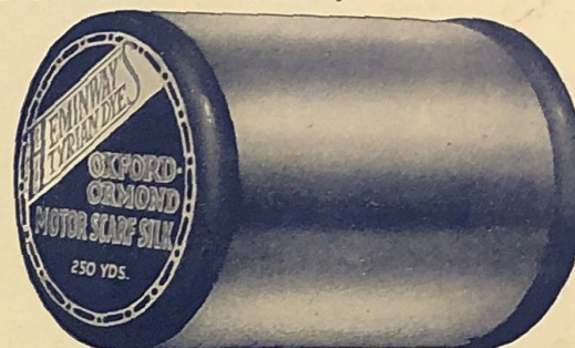
OXFORD-ORMOND SCARF SILK

IN executing the designs pictured in this book, you are cautioned to use only the special thread silks specified for each particular number. The ties have been carefully worked out with standard HEMINWAY SILKS, and unless these materials are used, the results cannot be guaranteed. Even good imitations of these high-quality silks cannot be used satisfactorily.