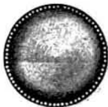
No. 824. Roman. $5 00