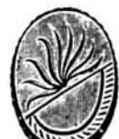
No. 828. Roman. $2 50