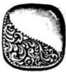
No. 827. Polished. $5 50