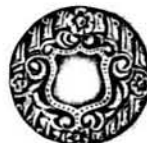
No. 826. Roman. $6 00