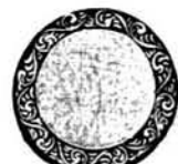
No. 825. Roman. $5 50