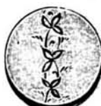
No. 829. Roman. $2 25