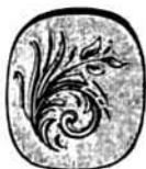
No. 830. Roman. $2 50